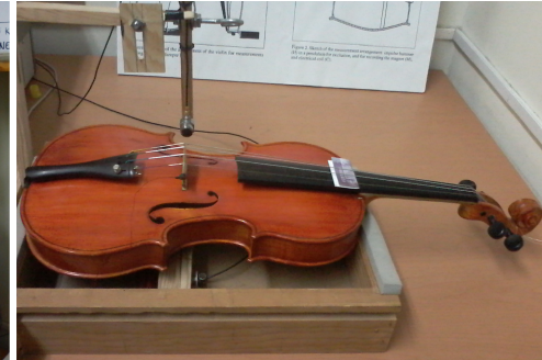
Fig. 1. Experimental set-up.

The mobilities were obtained using a dual IEPE channel spectrum analyzer. First, a pendulum was made to impinge on the bridge on the musical instrument and the impact was measured using a IEPE force transducer with an attached polymer tip (Fig. 1 right). An increase in the signal of this transducer, caused by the impact, triggered the capture on both channels during an instant. The vibration of the structure was measured through an ultra-miniature (0.4 g) IEPE accelerometer attached with wax, and its signal was digitally integrated to calculate the velocity. Each mobility was obtained averaging sixteen impacts, although the first four or five hits were enough to clean the obtained plots from noise.